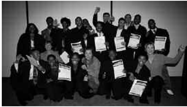
Umzi Wethu's first graduates proudly show their diplomas.