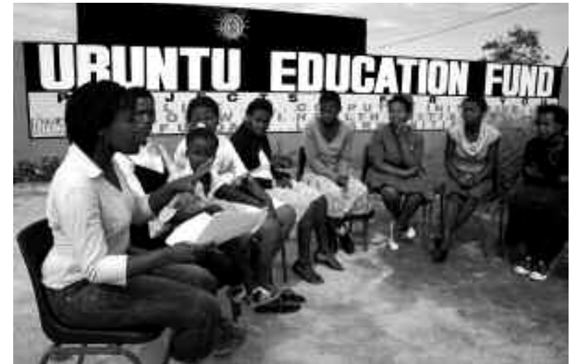
A young women's support group meets outside Ubuntu headquarters. All eagerly await the opening of The Ubuntu Centre so they will have private spaces to meet and counsel one another.