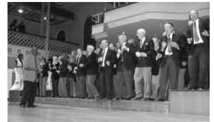
On June 29th, 228 Yale alumni visited Ubuntu in Zwide Township to learn about our work. That evening, the Yale alumni choir, The Yale Whiffenpoofs, threw a public concert in Port Elizabeth together with local choirs, Joy of Africa, General Motor's employee choir and Ubuntu's youth choir. All proceeds from this spectacular concert benefited Ubuntu Education Fund.